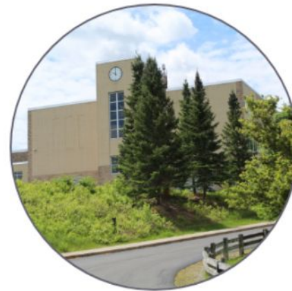
Junior High School