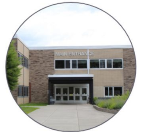
Cortland High School