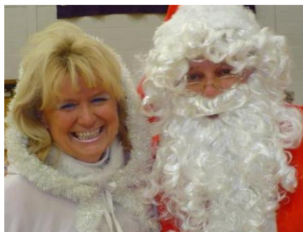
Mrs. & Mr. Santa Claus

Sorry, I like a good laugh every few moments (Santa wiped a few joyful tears from his eyes).