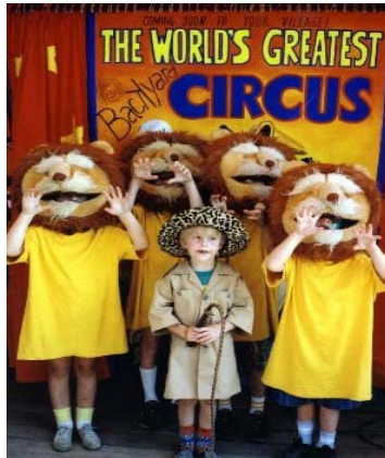
Family Puppet Parade